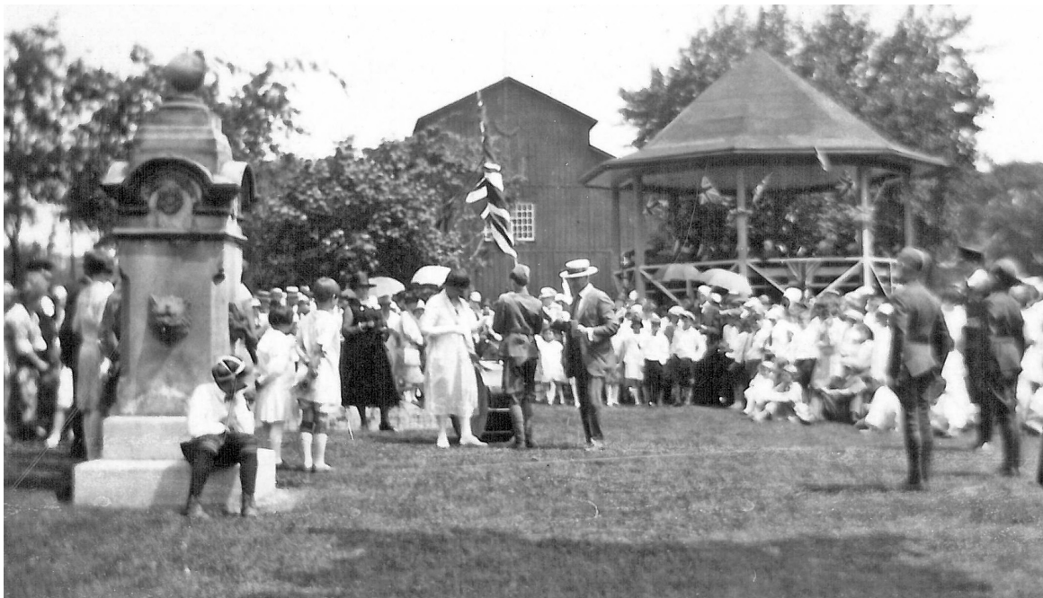
Ceremony in Memorial Park, c. 1920. Visible is Mayor Craig's Fountain, and the Drill Shed.