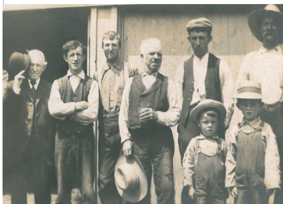
Group of Unidentified Workers in Hope Township, c1920 (PHA# 999-17-1-2932)

As it turns out, the farmers who first started the Port Hope & District Agricultural Society, over 184 years ago, had a lot invested in their fashion. Appropriate clothing could make or break their ability to bring in the harvest; to feed their families, and community.