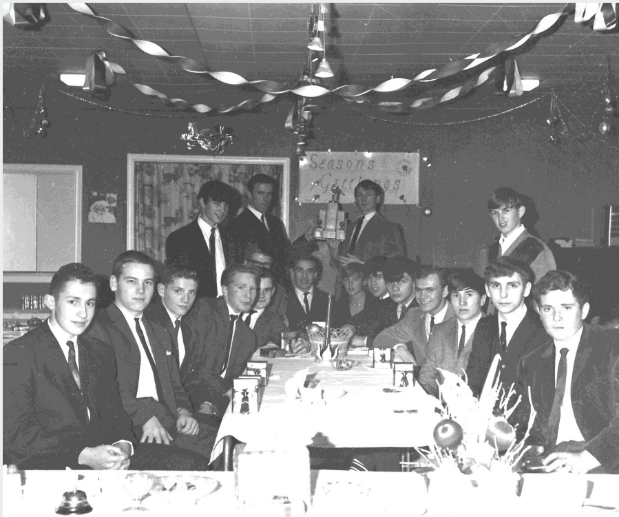
Port Hope Baseball Team Christmas Party, c1960