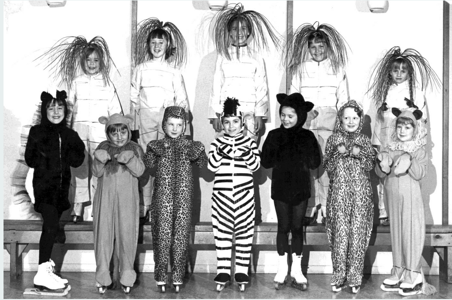
Port Hope Figure Skating Club, c1960s