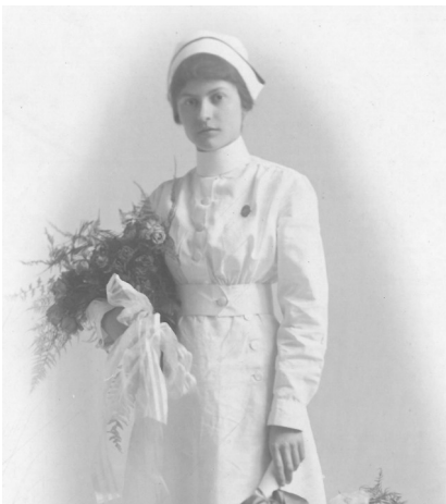
Left: Unidentified Port Hope Nurse, c1920