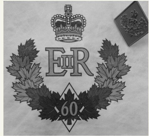
Received by the PHA on 28 May 2012, the royal visit materials consist of an invitation letter, flag, and commemorative lapel pin (2012.26.1).

Thanks so much for adding this interesting and timely collection to our holdings!