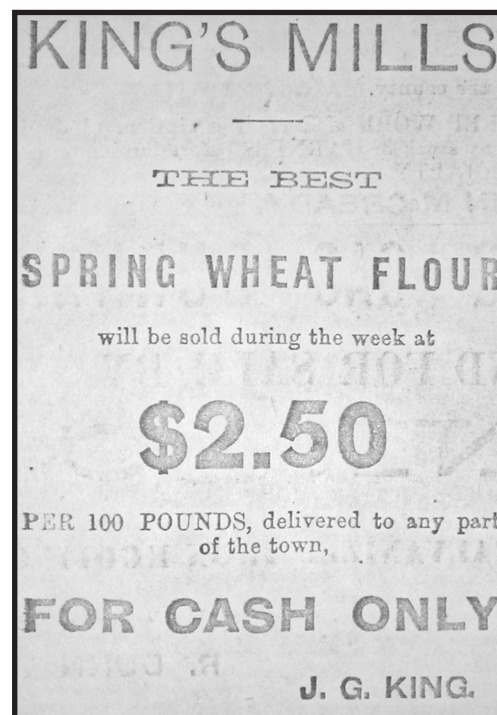
Advertisement for King's Mills, September 6, 1876 in the Port Hope Times shortly before the insolvent notices appeared in The Guide.

Following the failed attempt at milling, King moved