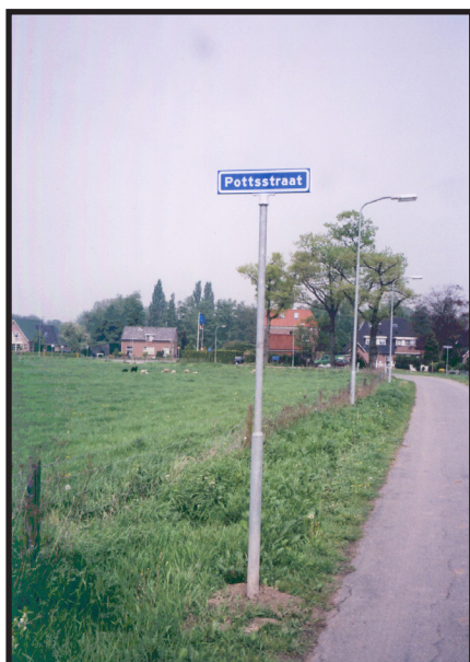
Pottsstraat in Zutphen, The Netherlands, is one of eleven streets named after Canadian Soldiers from the Stormont, Dundas & Glengarry Highlanders. A replica of the sign was sent to the Potts family and is now at the Port Hope Archives.

Military officials in London did not believe that an attack by the Japanese on Hong Kong was imminent, and it was expected that the Canadians would only see non-combat duty. However, that all changed when the Japanese military launched a series of attacks in