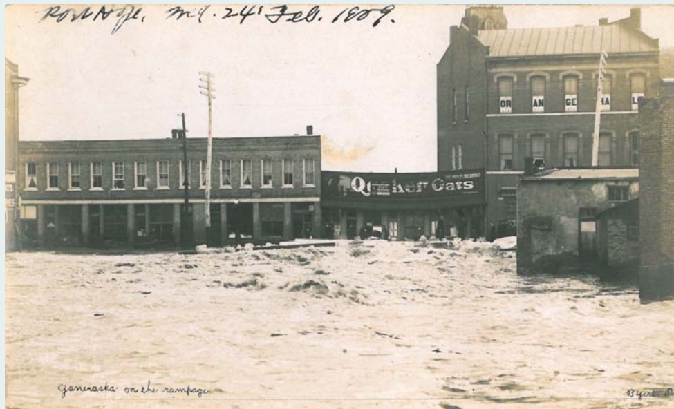
"Ganaraska on the Rampage," 1909