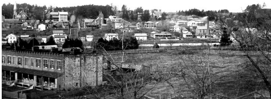
View of Port Hope facing west, featuring Wm. Craig's Tannery, 1872

All of the original pipes, hydrants and repairs were facilitated by John Helm's Foundry. Including the later development of a pumping station on the west bank of the Ganaraska River, by Town Hall.