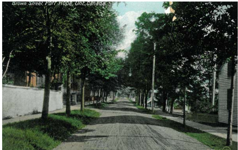
Brown Street Postcard, c1910