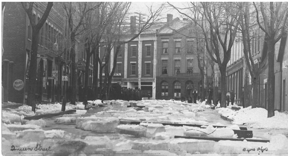
Port Hope Flood Postcard, 1909