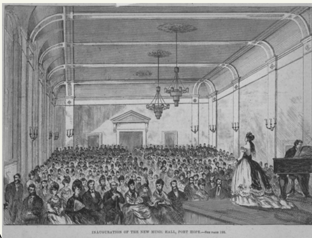
INAUGURATION OF THE NEW MUSIC HALL, PORT HOPE.—See page 105.

If you are as excited as I am about the opportunity to explore the old Opera House during Doors Open Northumberland this June; perhaps you have also pondered the history of the once-magnificent theatre.