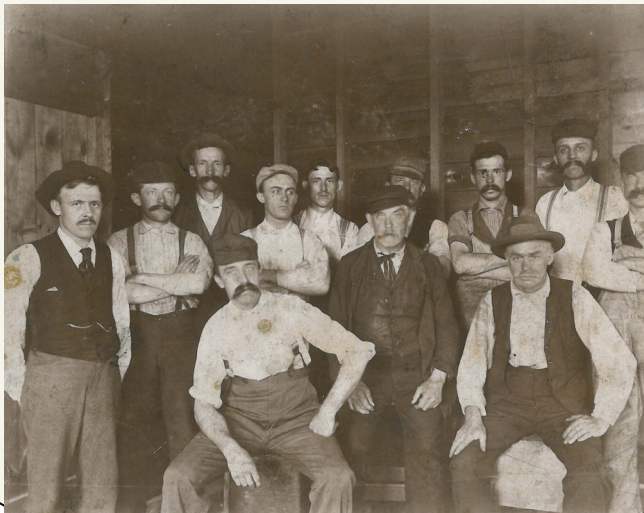
One of the many photos of factory employees. Nicholson File workers, 1902