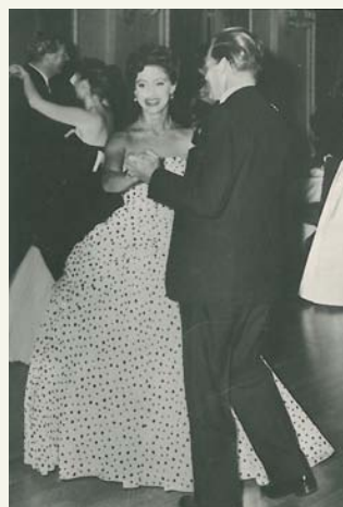
PHA 995-48-3-240 "Princess Margaret & Friend Dancing"