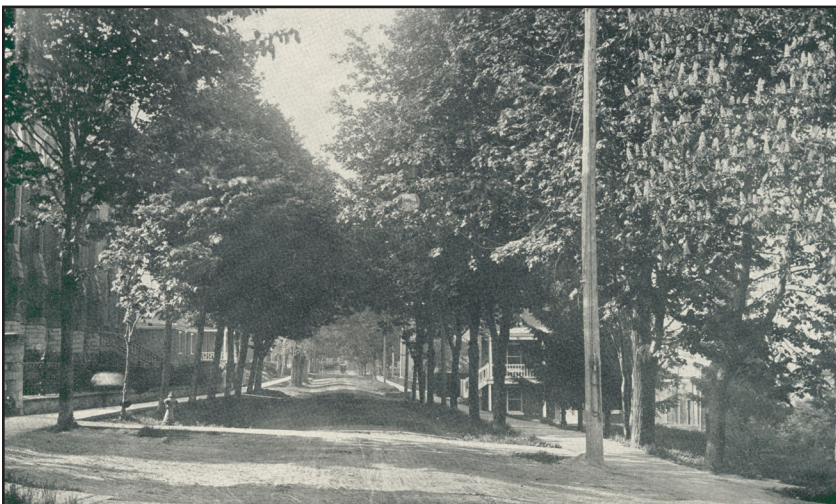
Brown Street, ca. 1905. The side of the Methodist Church (built 1878) is visible on the left.

access. The church at that time was on the opposite side of the street from the present church. According to the town minutes, Brown Street was to be made passable for wagons in 1837.