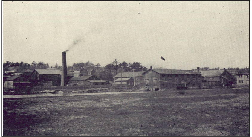
The Craig Tannery on Cavan Street, ca. 1901