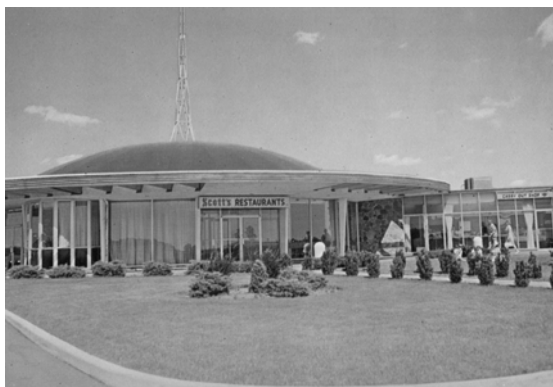
Greetings from Scott's Restaurants and Texaco Service Centre Postcard, c1960s

The highway was built with a focus to alleviate congested areas first, in a patch-work pattern. The section from Toronto eastward to Wesleyville was completed by December 1960, with the area from Port Hope to Brighton completed the following Spring (June 1961).