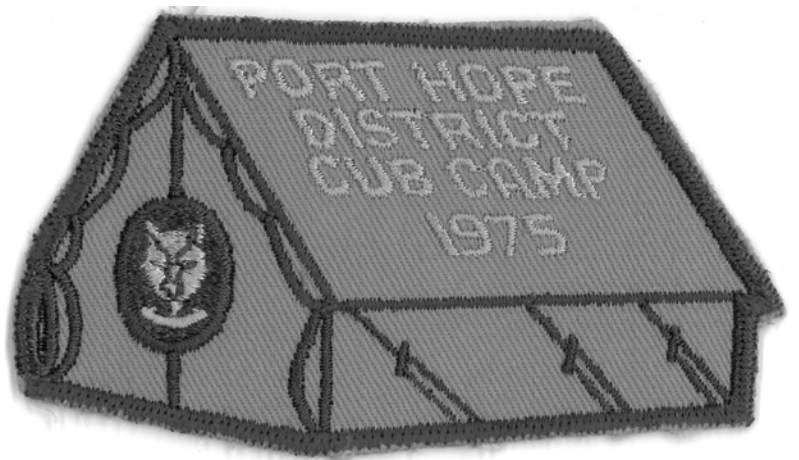
Port Hope District Cub Camp Patch, 1975 (PHA# 2013-36-8)

At the height of scouting in Port Hope District there were twelve (12) groups: 1st St. Mark's, 2nd Port Hope Baptist, 3rd St. Mary's, 4th St. John's, 5th Port Hope United, 6th St. Paul's, 7th Salvation Army, 8th Port Hope Welcome (later 1st Welcome), 9th Trinity College School, 10th Kiwanis (Howard Jordan School), 1st Perrytown, 1st Millbrook.