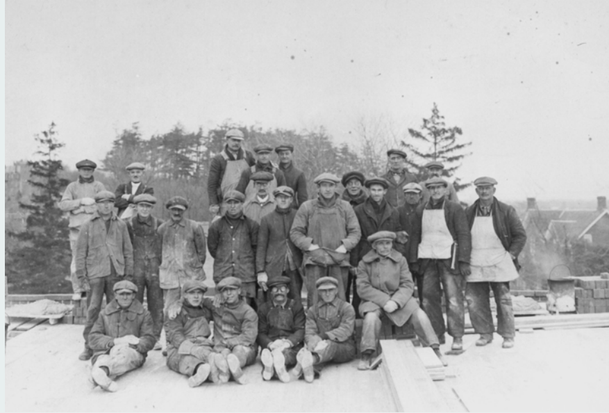
Builders, Port Hope High School Extension, Pine Street